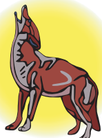
Arizona Desert Elementary

Summer Camp students will receive "Take-Home Book Packs" to support literacy!